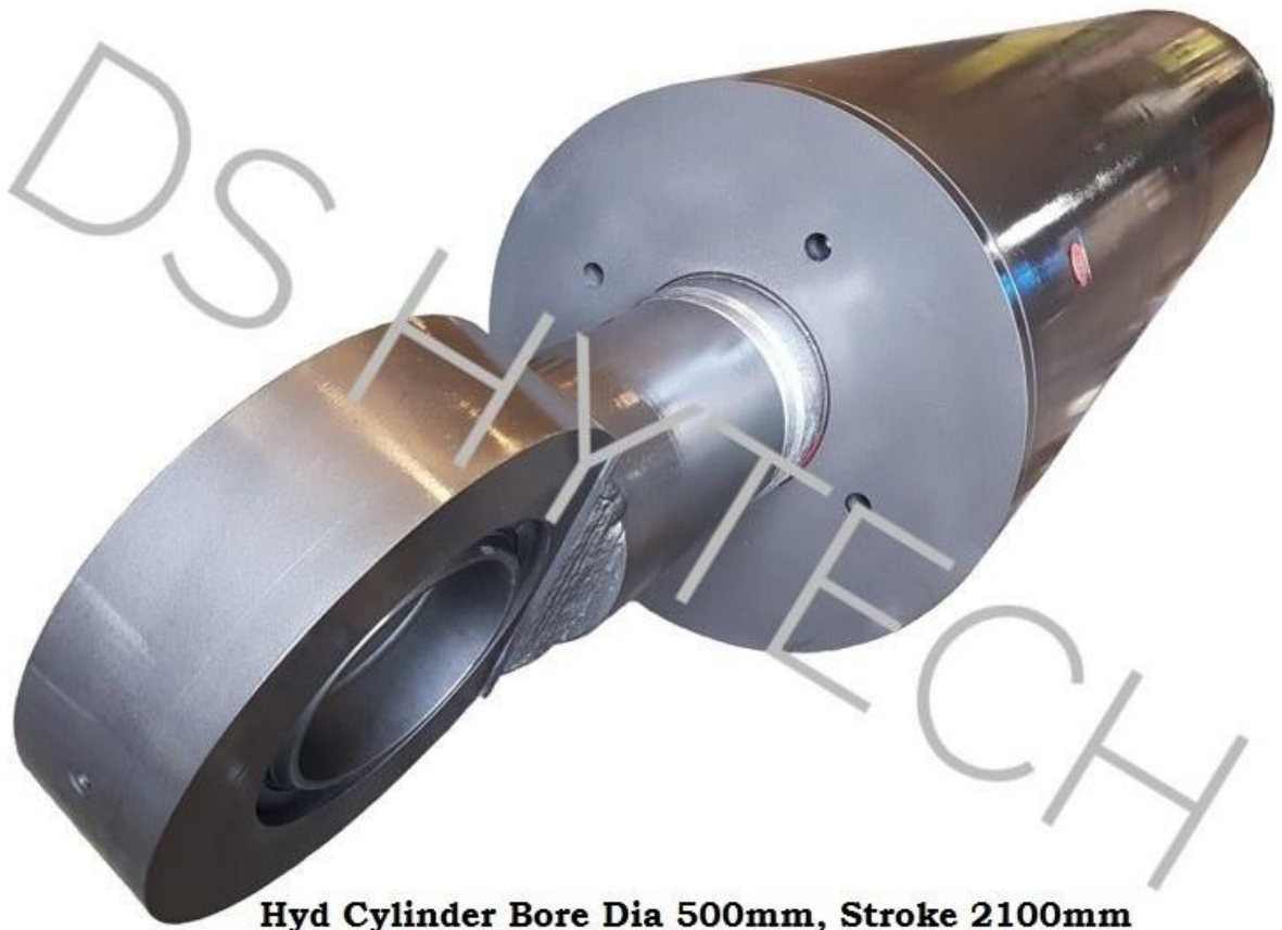
Hyd Cylinder Bore Dia 500mm, Stroke 2100mm

We also undertake Design & manufacturing of custom-built Hydraulic Cylinders with Bore Dia 600mm, upto Stroke 2500mm, Pressures up to 6,500 psi as per Customer drawings/samples with Custom sealing configurations & 3rd party certifications such as TUV and many more. We also carry out extensive & comprehensive reconditioning / up gradation / modification of all types of hydraulic cylinders which includes Telescopic Hydraulic Cylinders, extra long Hydraulic Cylinders and Hydraulic Cylinders with vintage/out dated designs where components and parts are not available.